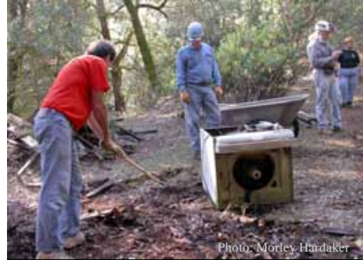
There's a lot of trash to be picked up from behind the shed.

volunteer sign up forms. Then our caravan of six pulled out: trucks and cars laden with what looked like a hardware store full of tools and 19 enthusiastic volunteers. Once at the property parked behind the gate, we consolidated and organized all the gear. There was