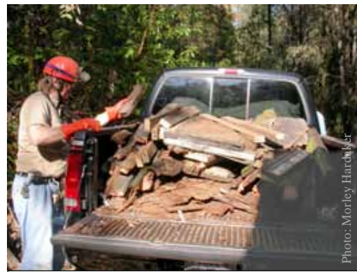
Ben loads his pickup truck with debris for a dump run.

on the building, rakes, shovels, tubs, and buckets for collecting debris, safety gear such as helmets, gloves, glasses and first aid kits, a toilet facility and plenty of water, other beverages and food for lunch. Once we had all this organized we listened to Marianne explain the work plan. Then Jerry and Dale went over basic