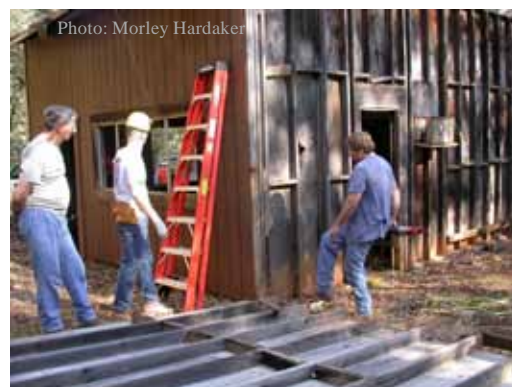
The shed's two free-standing walls are torn down.

safety rules and cautions for us to keep in mind. Activity sheets were handed out and job leaders designated.