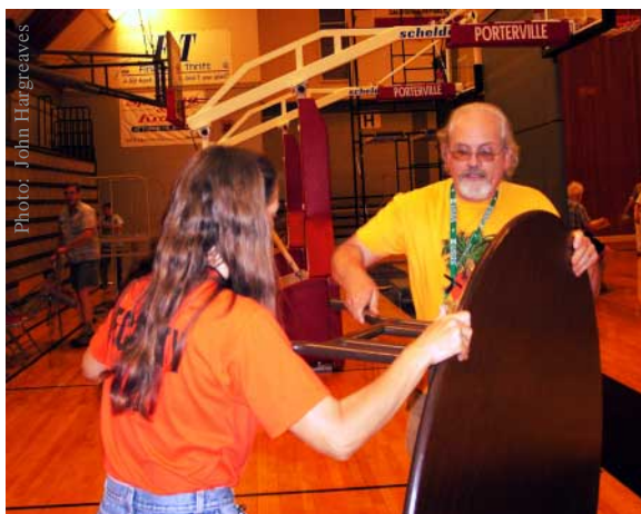
Volunteers at work at WCC's Banquet at the 2003 NSS Convention in Porterville, California

Our menu will include hamburgers and veggie burgers with all the trimmings, beans, potato salad, honeydew melon, and dessert, all for the very reasonable price of $10.00 for adults and $5.00 for children 12 and under. All proceeds above the cost of the meal are to benefit conservancy projects. Accompanying the meal will be a presentation updating attendees on the conservancy's activities and plans. We are looking for assistance with serving